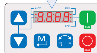
NEMA1 (Up to 10HP) Keypad